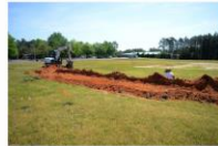
BOGEY BALLPARK - PINEHURST, NC SPRING OF 2022

PREVIOUS BALLPARK CONSTRUCTION PROJECTS COMPLETED BY WILKES COUNTY BASEBALL OWNERS