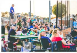
BOGEY BALLPARK - HOME OF THE SANDHILLS BOGEYS

TRAMWAY PARK - HOME OF THE SANFORD SPINNERS