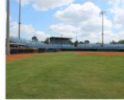
3RD RIDGE STADIUM - HOME OF THE FAYETTEVILLE CHALITES