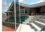
JACK HUGHES BALLPARK - HOME OF THE PINEVILLE PORCUPINES