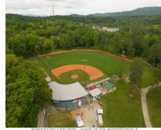
BERKELEY MILLS BALLPARK - HOME OF THE HENDERSONVILLE HONEYCRISPS